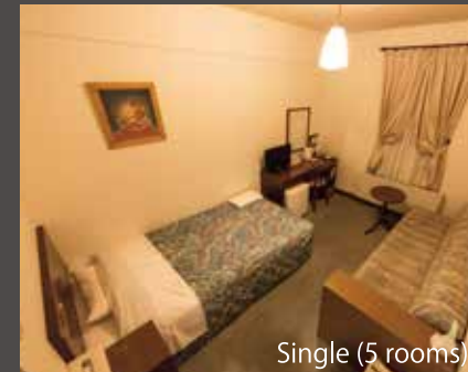
Single (5 rooms)