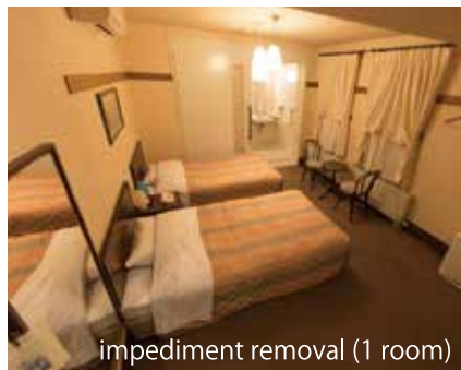
impediment removal (1 room)

It is located in the middle of tourist and business center of the town and easily accessible from Hakodate, Kikonai, Matsumae by means of car and bus and by ferry from Okushiri Island.