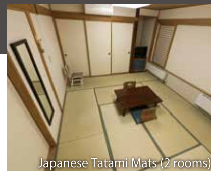
Japanese Tatami Mats (2 rooms)

All rooms Include: Bath & Washlet Toilet, Air Conditioner, Air cleaner, Refrigerator