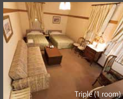
Triple (1 room)