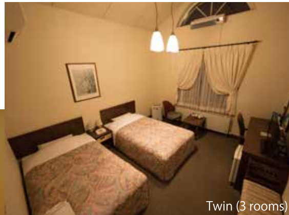
Twin (3 rooms)